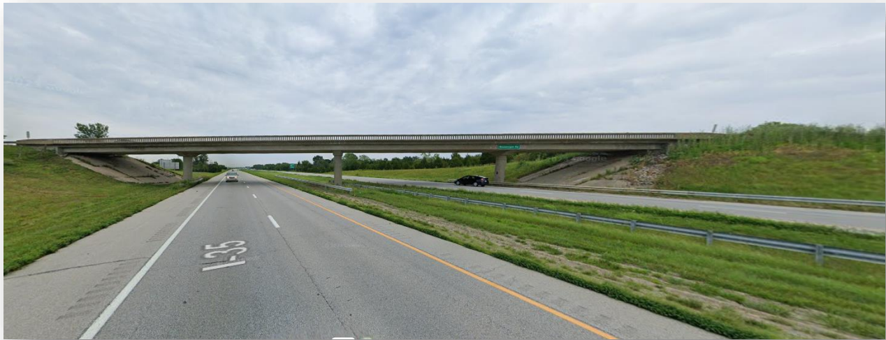
South Moonlight Road over I-35