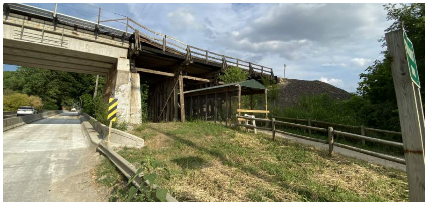
Looking Southeast at the Project Area