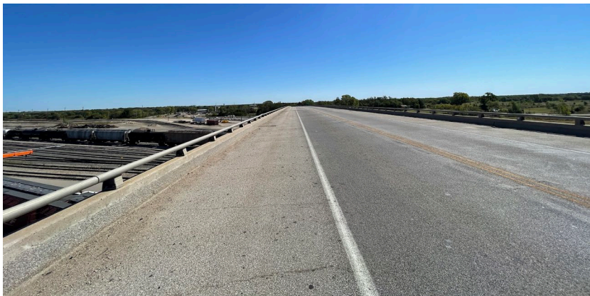
U.S. 50 bridge over BNSF railway