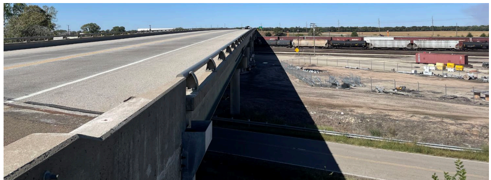
U.S. 50 bridge over BNSF railway

IKE—The Eisenhower Legacy Transportation Program —is a roughly $10 billion investment in the future of Kansas. IKE is a rolling program focused on right-sized, practical improvements. Modernization and expansion projects are selected for design every two years in conjunction with state-wide outreach meetings, called Local Consult.