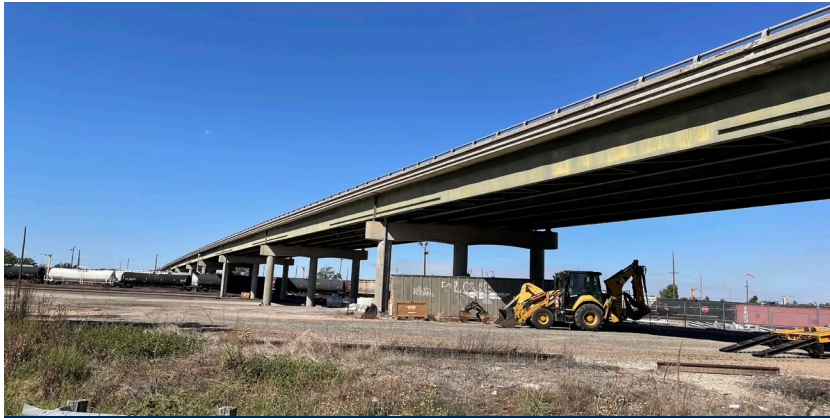
Existing BNSF bridge looking west from 14th Street