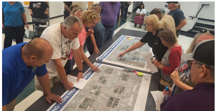
Community members listen to presentation during the third public meeting