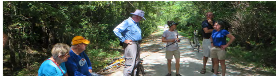
People Hanging Out on Prairie Sunset Trail.

Consumers can be organized into groups by their common characteristics. The groups are known as Market Segments. The top market segments in Kansas to consider for active tourism communications include: