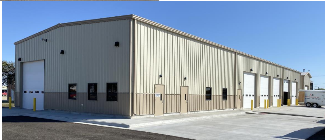
Clay Center After