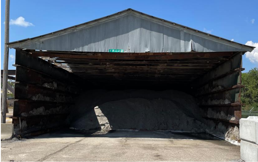
FY24 Gage Subarea - 1950