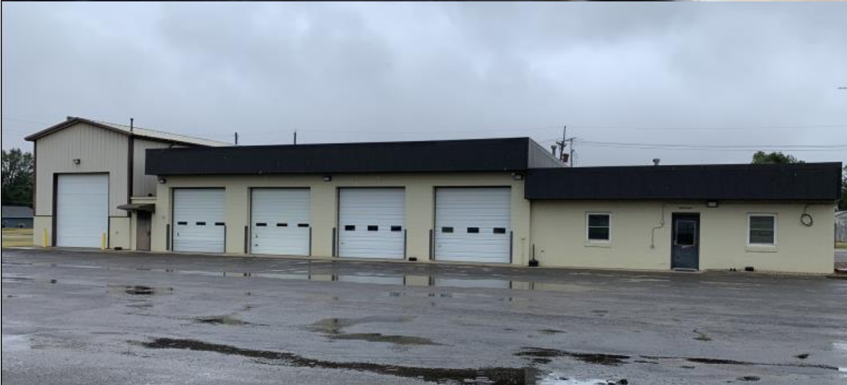
Lyons – 1960