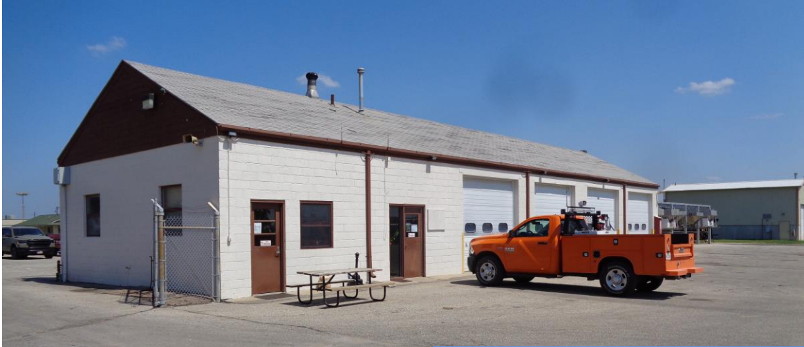
Clay Center Before