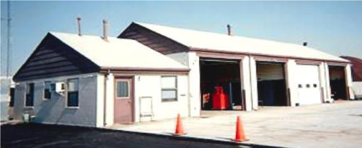
Lincoln – 1959